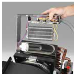
The assembly for the optional electric heater (top) and Breathe Easy air purifier (bottom) fits between the coil and blower (standard AU model shown).