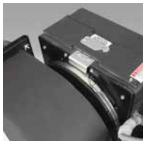
The Gold air handler's HV blower can be easily rotated in the field by loosening the single adjustment screw on the blower collar (standard AU model shown).