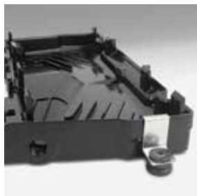
The drain pan features anti-slosh, positive-flow condensate channels, reinforced drain holes, and moveable vibration-isolation mounting clips.

The optional integrated Breathe Easy air purifier is positioned directly in the airstream and uses ultraviolet (UV) light and photocatalytic nano-mesh technology to improve air quality without producing any harmful ozone. The award-winning Breathe Easy eliminates odors and up to 99.9% of VOCs and biological contaminants.