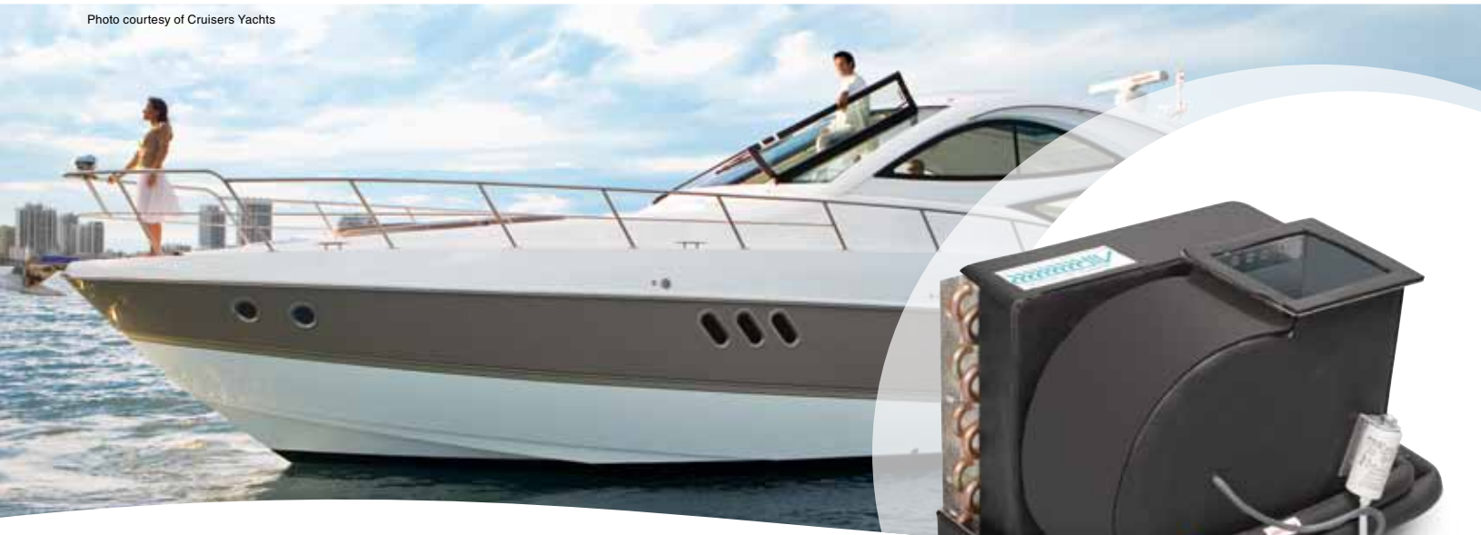
E9FDZ/1-HV DX air handler shown

The Marine Air Direct Expansion Air Handler has a compact modular design. For maximum efficiency, the plenum chambers are increased and the coils have enhanced fins and rifled tubing. The unit also offers easy disassembly for access to components.