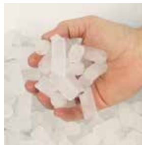
Special cylindrical ice shape maximizes ice density for superior cooling and slower melting.