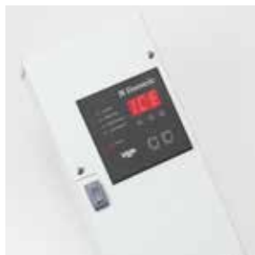
Smart Logic control with electrical box can be mounted remotely for easier access.