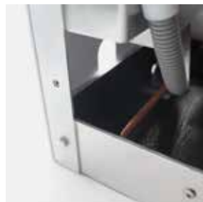
Side panels and frame can be removed to fit through small hatches.