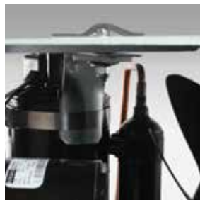
Compressor is bracketed at top as well as bottom to minimize vibration and movement while under way.