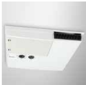
The air distribution box (sold separately) mounts on the ceiling to provide A/C controls.