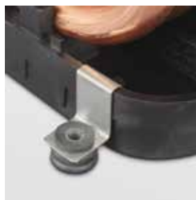
Vibration-isolation mounting clips reduce vibration and noise.