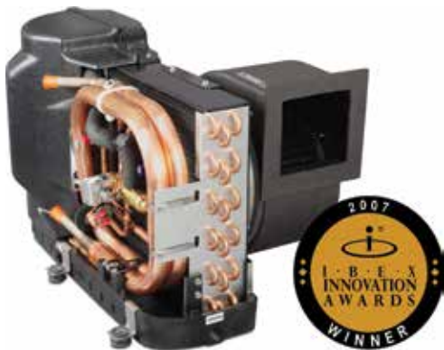
Turbo air conditioner shown with optional sound cover

Powerful, Quiet & Compact With No Drain Pan Worries