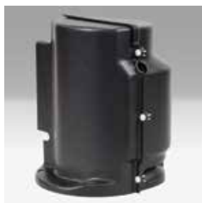
Optional sound cover further reduces compressor noise by up to 50%.