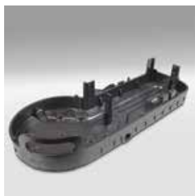
Redesigned composite drain pan is stronger with beefed-up drain threads to resist cracking.

The optional Turbo sound cover provides up to 50% further noise reduction. This compact, easy-to-install sound cover completely encases the compressor to provide a 3- to 5-dB reduction in noise. Available for all Turbo models, the sound cover installs in minutes. Mounting hardware is included.