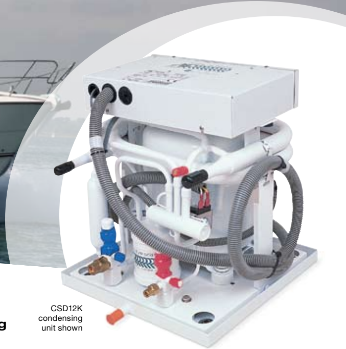
CSD12K condensing unit shown

The CS series of condensing units provide heating and cooling ability in a highly efficient package. The hermetically sealed, high-efficiency compressor reduces amp draw, while pressure switches, thermal-overload and start components provide constant system protection and proper operation. In addition, the expansion device and check-valve assemblies control load balancing during operation. The system's copper-encased cupronickel condenser coils are highly resistant to corrosion that can be caused by continuous seawater flow.