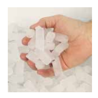
Special cylindrical ice shape maximizes ice density for superior cooling and slower melting.