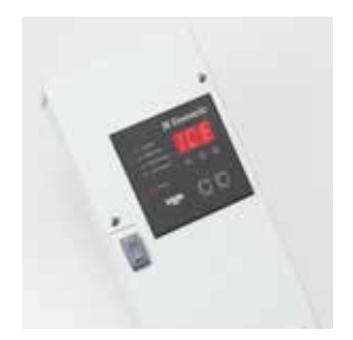
Smart Logic control with electrical box can be mounted remotely for easier access.