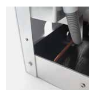
Side panels and frame can be removed to fit through small hatches.