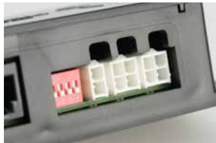
RV-C network connection for centralized user interface operations