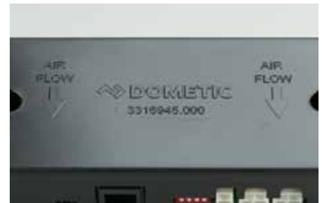
Easy installation designed to mount in airway path