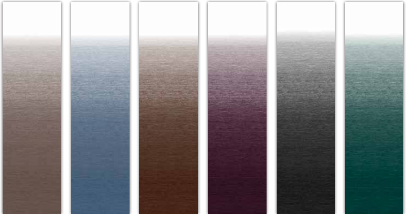
Sandstone Color Code: NS