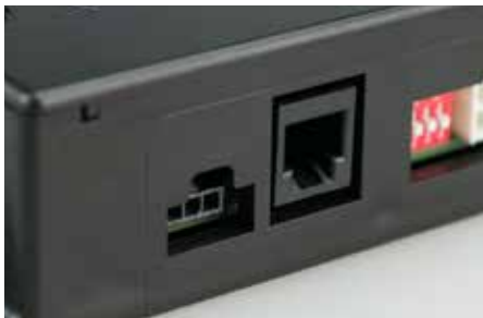
Multi-function gateway connecting air conditioning, furnace, and Fan-Tastic Vent fans