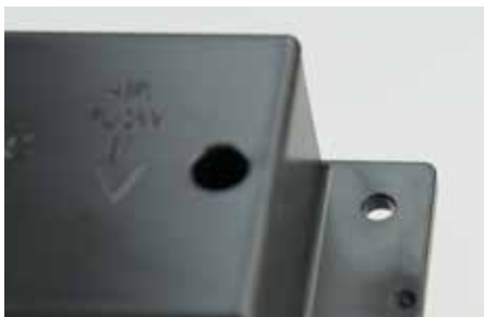
Alternate remote installation from air conditioner or utilize with Fan-Tastic Vent fan only