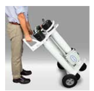
Easy to transport

The Dometic Spot Zero mobile wash down system is not a water softener. Water softening is an ion exchange process which, in theory, treats feed water "hardness" by removing one chemical from a feed water source through the addition of another chemical. The Dometic Spot Zero mobile wash down system is fundamentally different in that our system utilizes the most advanced reverse osmosis technology to separate pure water (H2O) from any and all contaminants in a feed water source (including, but not limited to, just hardness in the water). The water softening process was not designed to do, and doesn't claim to do, what reverse osmosis does. Water processed through the Dometic Spot Zero mobile wash down system is bottled-water quality and can be used onboard for virtually any purpose.