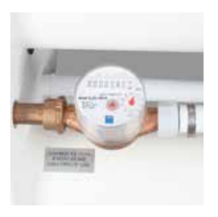
Keeps track of gallons processed